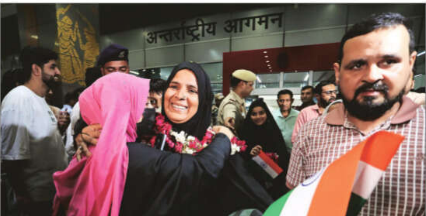
An Indian student returning from Iran reacts after meeting her relatives at the Indira Gandhi International Airport on Saturday

"The citizens of Nepal and Sri Lanka may urgently reach out to the Embassy, either on