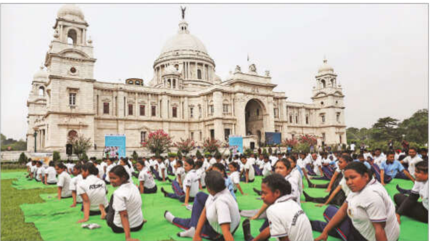
People perform yoga at Victoria Memorial, in Kolkata on Saturday

Tensions between India and Pakistan escalated after the April 22 Pahalgam terror attack, with India carrying out precision strikes on terror infrastructure in Pakistan and Pakistan-occupied Kashmir on May 7.