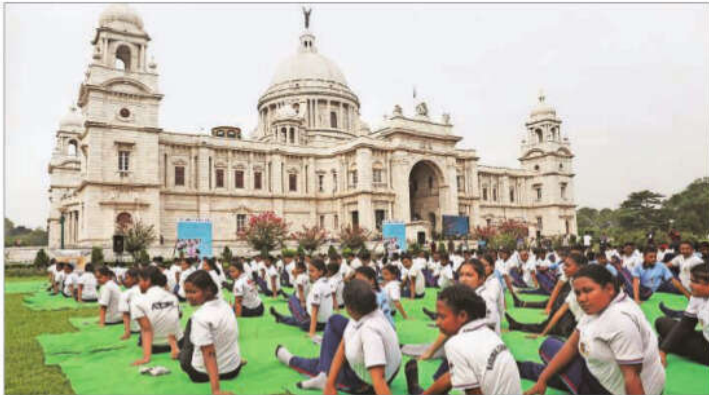
People perform yoga at Victoria Memorial, in Kolkata on Saturday

Tensions between India and Pakistan escalated after the April 22 Pahalgam terror attack, with India carrying out precision strikes on terror infrastructure in Pakistan and Pakistan-occupied Kashmir on May 7.