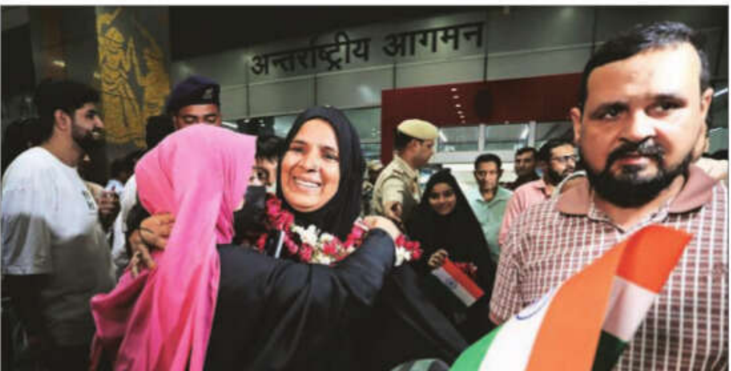
An Indian student returning from Iran reacts after meeting her relatives at the Indira Gandhi International Airport on Saturday

"The citizens of Nepal and Sri Lanka may urgently reach out to the Embassy, either on