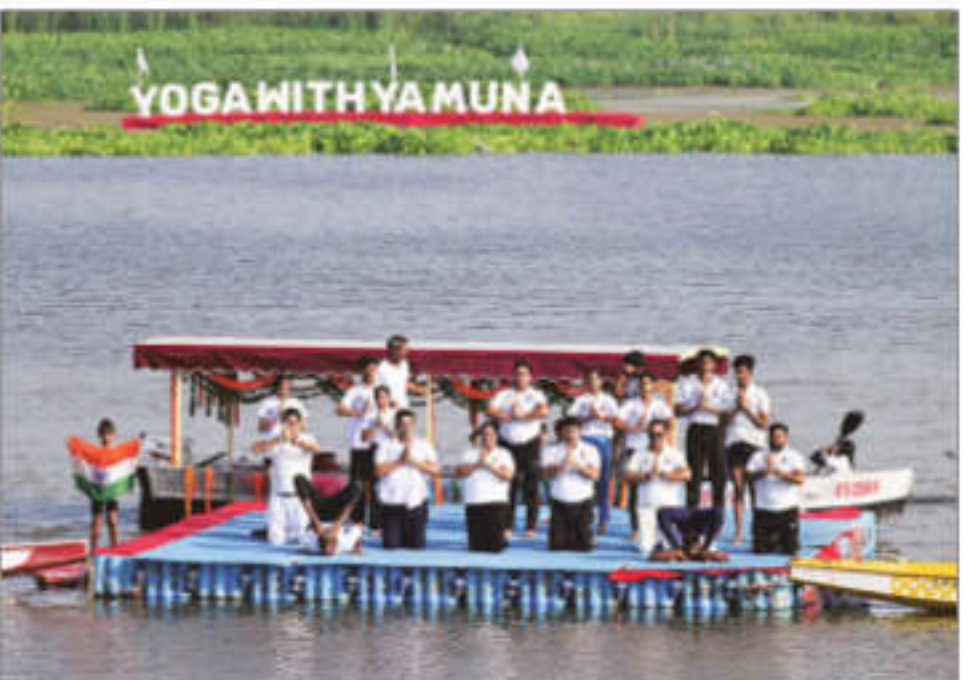
Delhi chief minister Rekha Gupta performs yoga on Saturday

"My request to the world -- let this yoga day mark the beginning of yoga for humanity 2.0, where inner peace becomes global policy," the PM said. He said the theme of this year's International Day of Yoga is 'Yoga for One Earth, One Health', which reflects a deep truth that the health of every entity on Earth is interconnected. Human well-being depends on the health of the soil that grows food, on the rivers that give water and the